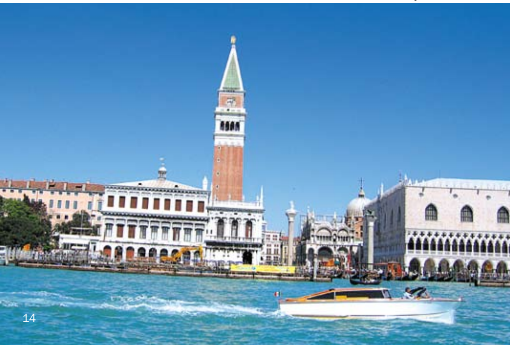
Venice - Queen of the Adriatic Sea

Overnight at hotel Novotel/NH or similar in Ferrara/ Bologna.