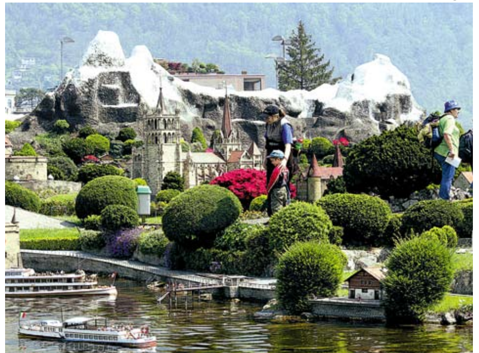
Swissminiatur – Lugano

Enjoy an Indian lunch and drive to the beautiful lakeside town of Lucerne. See the dramatic Lion Monument and the Kapell Brucke as you soak in the beauty of the city. You also have some free time