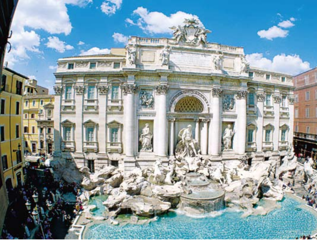
The majestic Trevi Fountain – Rome

the Santa Croce where Michelangelo and Galileo are buried. Also see the Ponte Vecchio - a medieval bridge over the River Arno, noted for having exquisite jewellery shops.