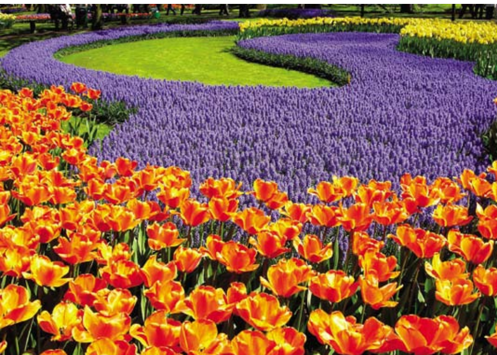
The beautiful Keukenhof Gardens

Photo stop at a traditional windmill. Onto Cologne - the dramatic German city.