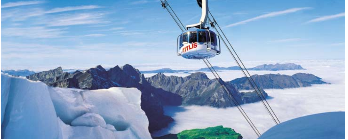
World's first revolving cable car – Rotair, Mt. Titlis

to shop for the world-renowned Swiss watches, Swiss knives, Swiss chocolates, souvenirs, etc.