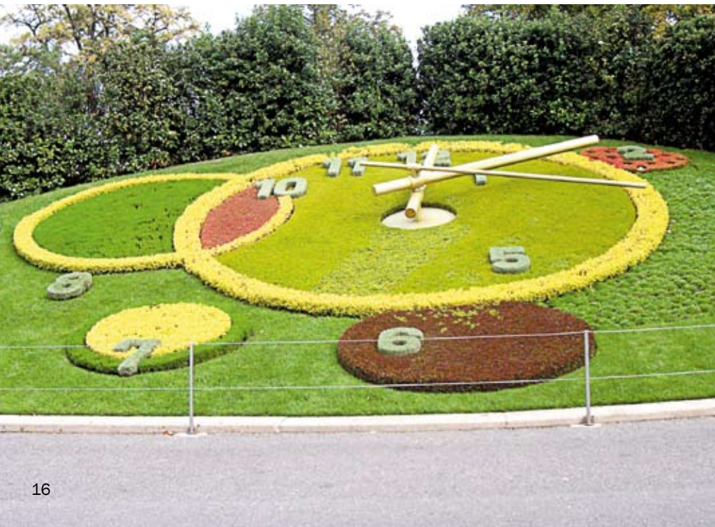
Floral Clock – Geneva

See the European headquarters of the United Nations, the International Red