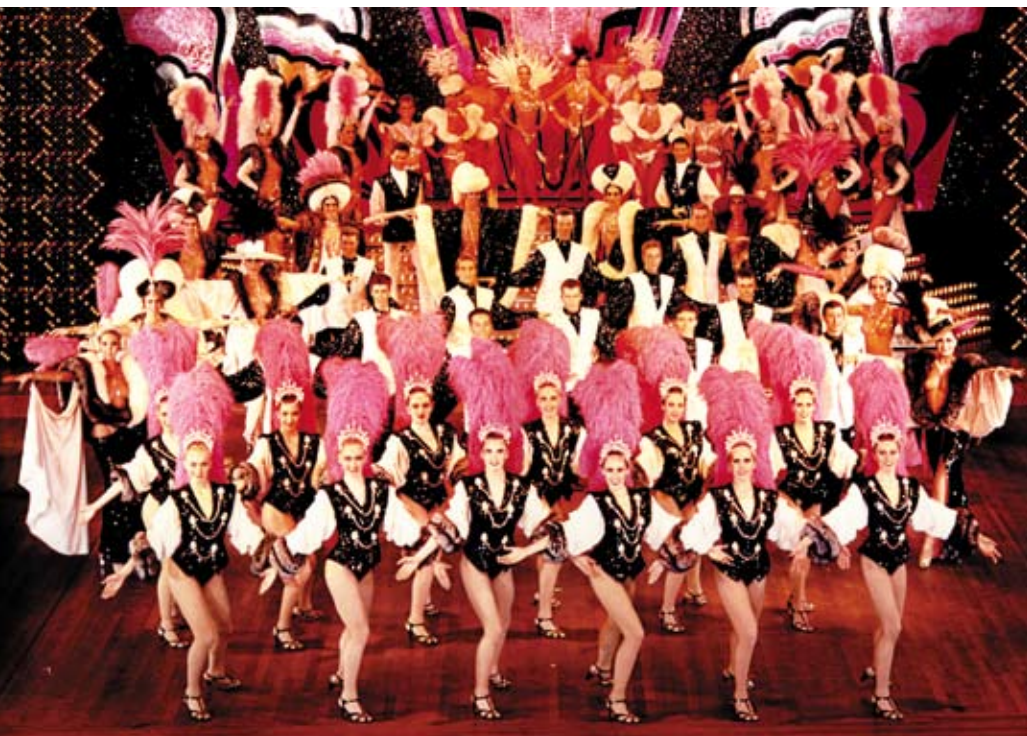
Spectacular Lido Show - Paris

After a buffet breakfast, get set to experience the Disney Magic as you visit Eurodisney - where dreams come to life.