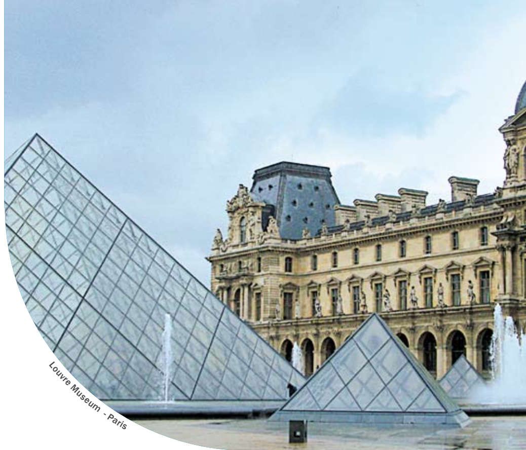
Louvre Museum - Paris

After a buffet breakfast, check out and proceed to the French Capital - Paris, a city seeped in history, art and fashion. Enjoy lunch en-route. On arrival into Paris proceed directly to your hotel and check in. Today, enjoy a cruise on the river Seine and admire the beautiful monuments of this spectacular city. Later, live the Parisian highlife on your gala dinner with great music and unlimited wine. Overnight at hotel Mercure La Defence/Novotel/Holiday Inn or similar, in Paris.