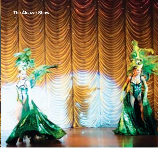
The Alcazar Show