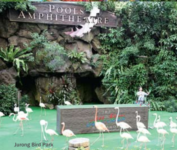
Jurong Bird Park