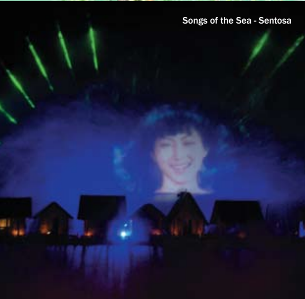
Songs of the Sea - Sentosa

stores like Sogo, MBK Centre, Gaysorn Plaza, Lotus etc. You can also enjoy bargain shopping at Indra market, BoBe market and Indian market. Tonight enjoy an Indian dinner.